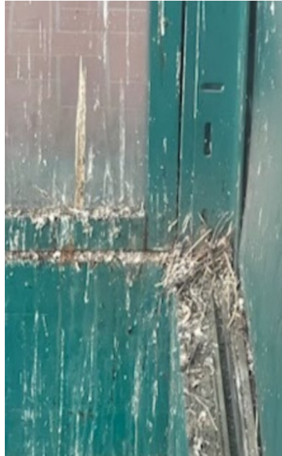
IDS Elevator 903 Before