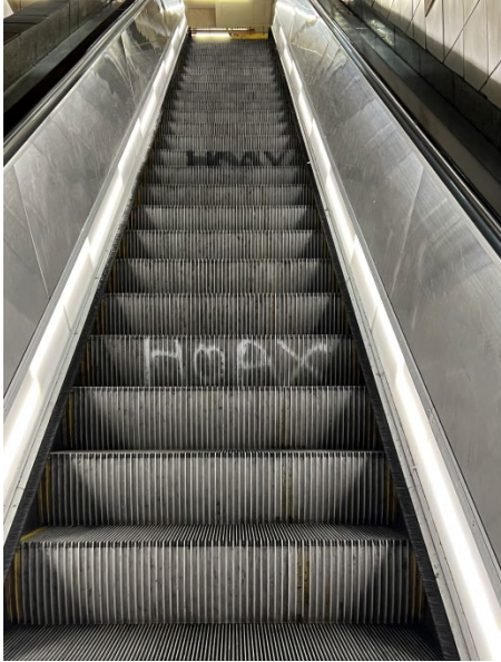
WLS Escalator 311 Before