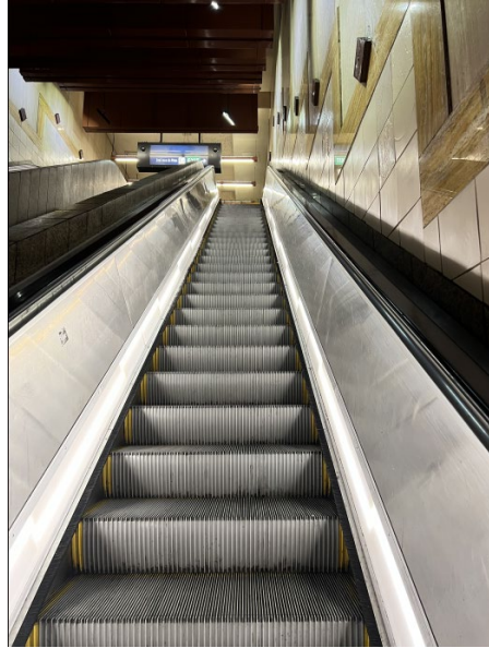
WLS Escalator 311 After