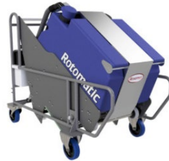
Rotomatic Step Cleaner