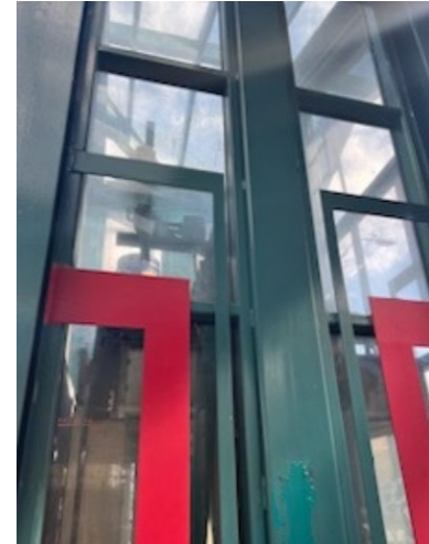
IDS Elevator 903 After