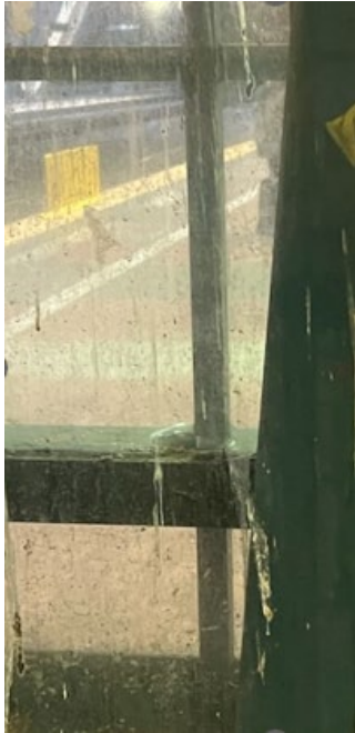
IDS Elevator 903 Before